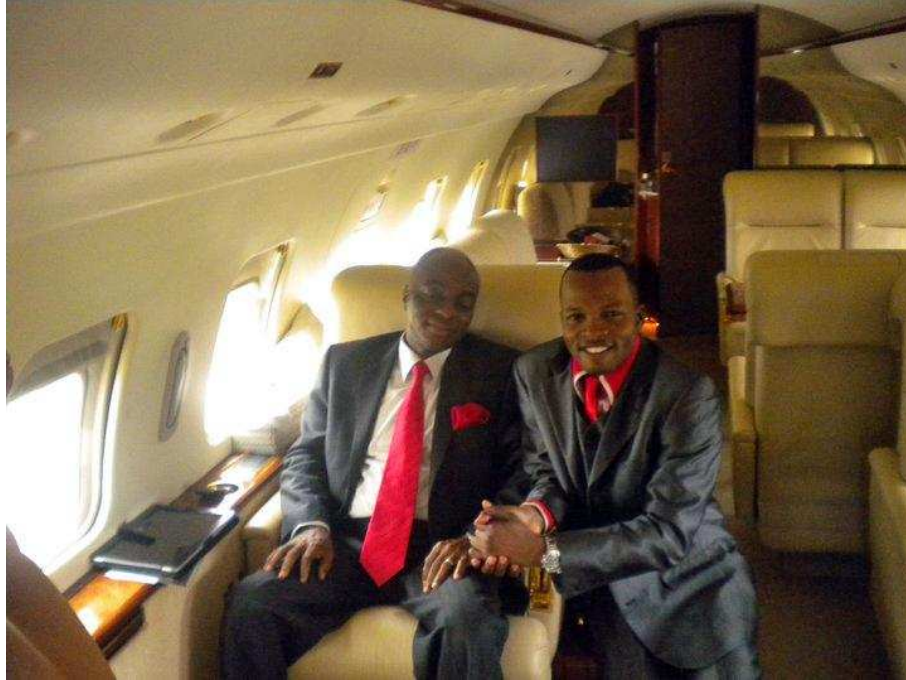
Figure 13: David Oyedepo, left, relaxing on one of his five corporate jets.