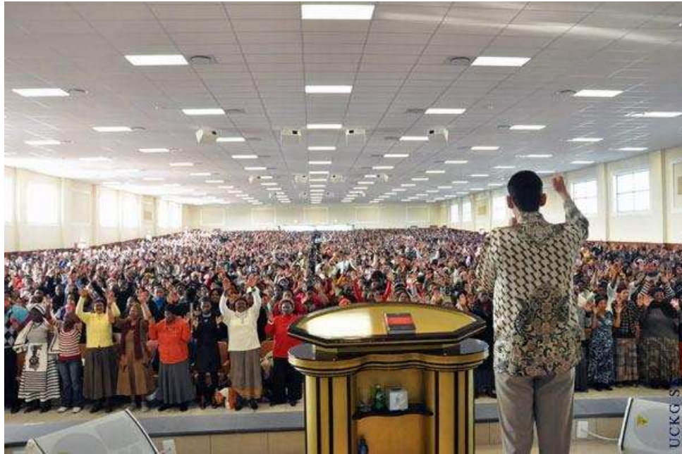
Figure 6: Grand Opening of the new UCKG church in Khayelitsha, South Africa.

it is now sending black, English-speaking South Africans as missionary ministers throughout sub-Saharan Africa and to England, the United States, and the Caribbean. 411