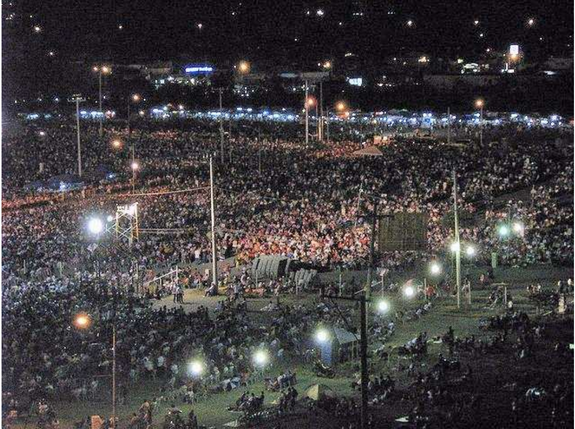
Figure 4: El Shaddai evening rally, Manila.