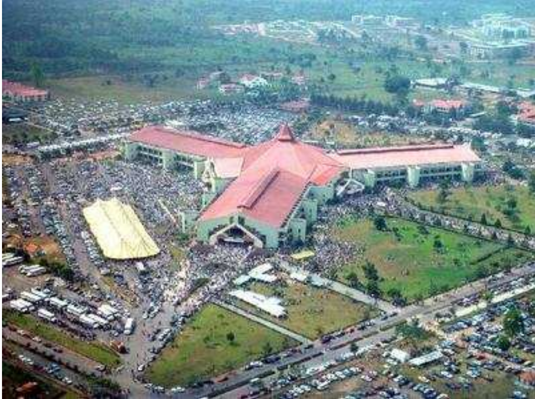
Figure 12: The world's largest church building, Faith Tabernacle, Canaanland, Nigeria.

Winners' Chapel in Lagos is filled to its capacity of fifty thousand for four separate services each and every Sunday, and the denomination now has five thousand churches in Nigeria and another six hundred around the world. 616