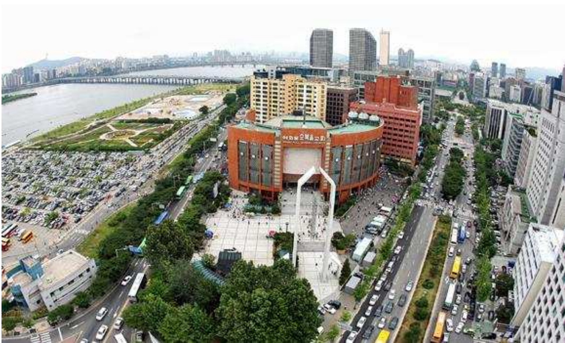
Figure 3: The Yoido Full Gospel Church, Seoul, Korea.

hundred thousand member mark, complete with seven hundred pastors, all under the direction of Cho. 153 Clearly it had become the largest church in the world, a fact recognized by the Guinness Book of World Records in 2005. 154 More significantly for the Pentecostal movement, Cho's cell group concept was widely emulated, particularly its emphasis on the use of female worshippers as lay leaders.