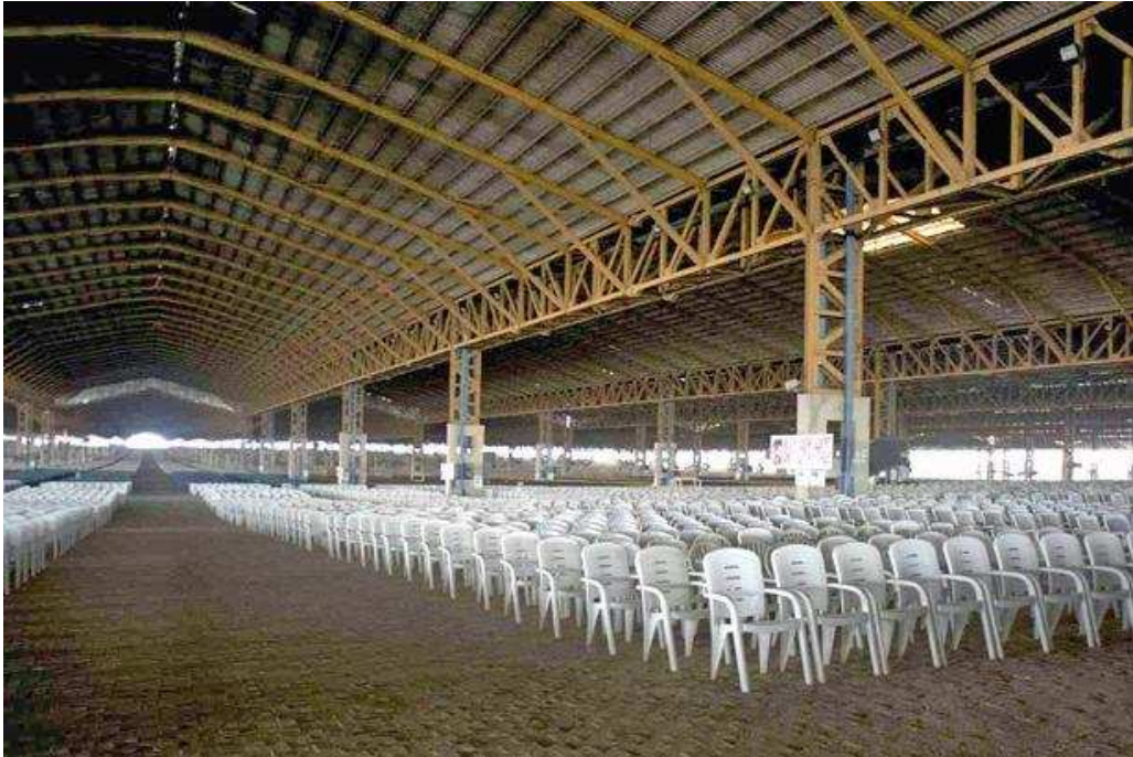
Figure 10: Redemption Camp, Nigeria, 2013.