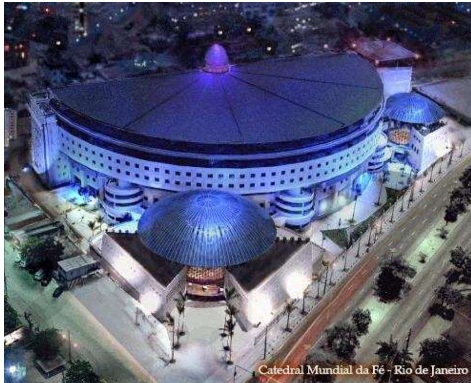
Figure 5: Catedral Mundial da Fé-Rio de Janeiro.