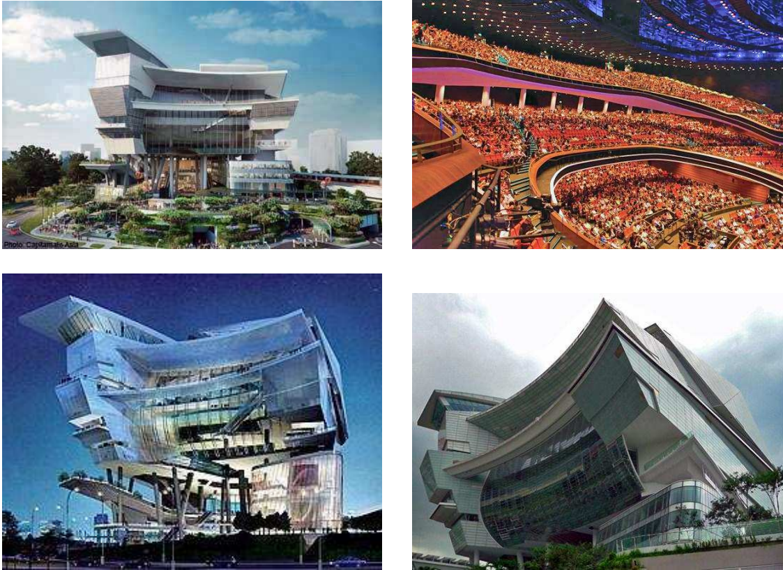
Figure 14: New Creation Church, Singapore.

These churches and their members do not measure up to Martin's stereotypical Pentecostal on several counts. The members are for the most part affluent, well educated, and belong to the dominant ethnic group of the country. They are also from families who have lived in Singapore for several generations, and they are in no way part of a migrant community. In no sense of the word could they be portrayed as marginalized, as was the case described earlier with the socially marginalized, but wealthy, ethnic Chinese community in neighbouring Malaysia and Indonesia. Why then have such large numbers of this non-marginalized community turned to a prosperity gospel-centric brand of Pentecostalism? For a possible answer to this question, it is most helpful to turn to an intriguing line of thought proposed by Gerard Jacobs.