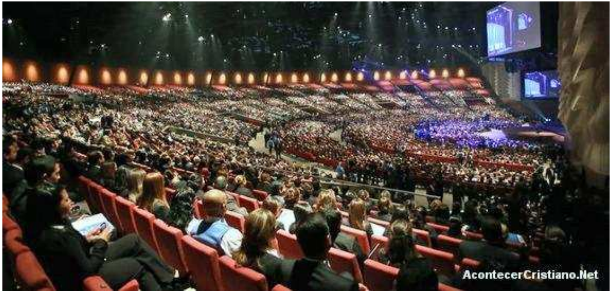
Figure 8: Casa de Dios-Guatemala City. The new megachurch of Cash Luna.

anthems and hymns that stoked both Pentecostal and patriotic fervor. 460 As both Calballeros and Luna have demonstrated, dynamic Pentecostal growth and the prosperity gospel are thriving in Guatemala.